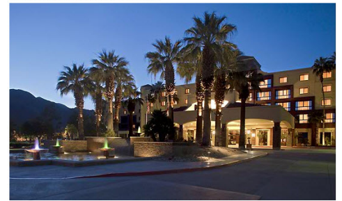
Renaissance Palm Springs Hotel

“Save the date for the 30 th CDC Annual Educational Conference” April 12 ~ 14, 2012